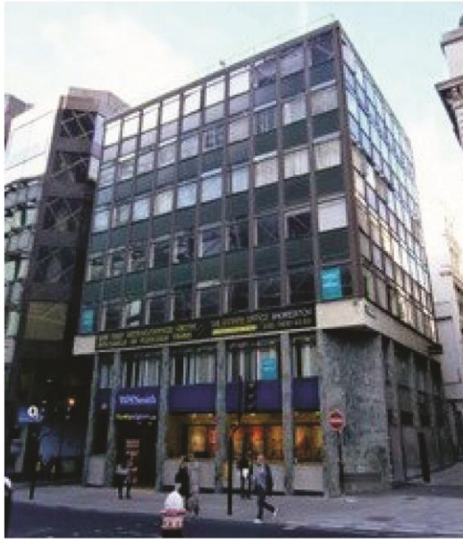
Front elevation looking north from Cannon Street