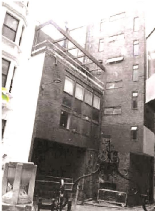
Rear elevation in Salters Hall Court looking south